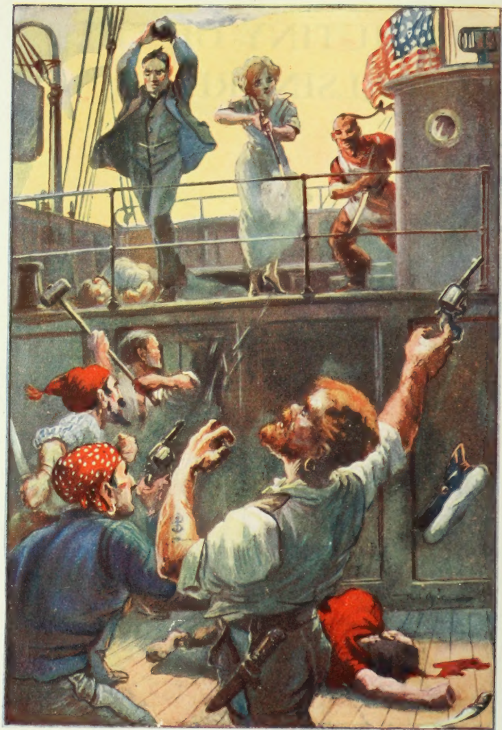
THE MUTINY OF THE ELSINORE